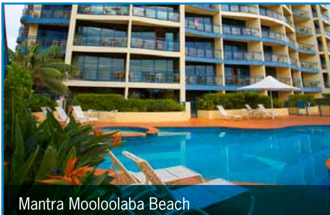
Mantra Mooloolaba Beach

The Sunshine Coast is the perfect mix of coast and country and the ideal place to relax and unwind. Whether you visit our properties at Mooloolaba, Alexandra Headlands or Rainbow Beach you are sure to find a piece of sand just for you. To see our latest Sunshine Coast specials please go to www.departurelounge.com.au Your password is: memberb