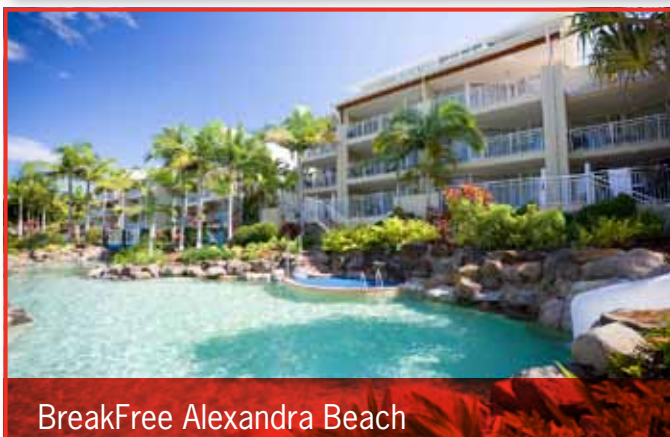
BreakFree Alexandra Beach

Set in secluded bushland between Rainbow Beach and World Heritage listed Fraser Island, BreakFree Rainbow Shores offers the perfect beach holiday in a pristine natural setting.